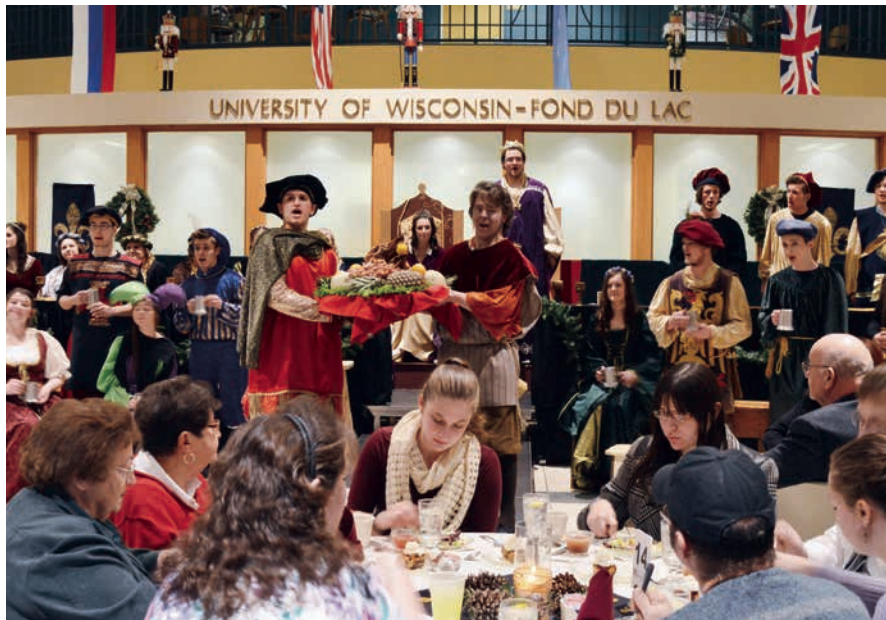
A Renaissance-inspired meal was enjoyed by guests during the show.