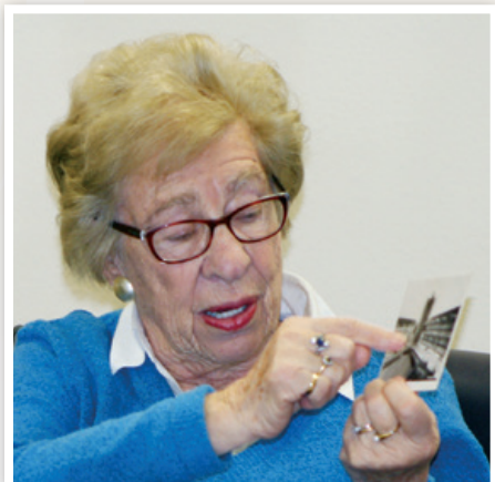
Eva Schloss shared her mother's passport and family photos during her campus visit.