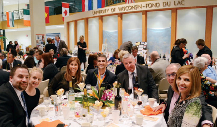
The guests at the 2015 Corks & Forks raised more than $27,000 for student scholarships and the UW-Fond du Lac Foundation while enjoying a four-course Caribbean-inspired dinner served with selected wines.